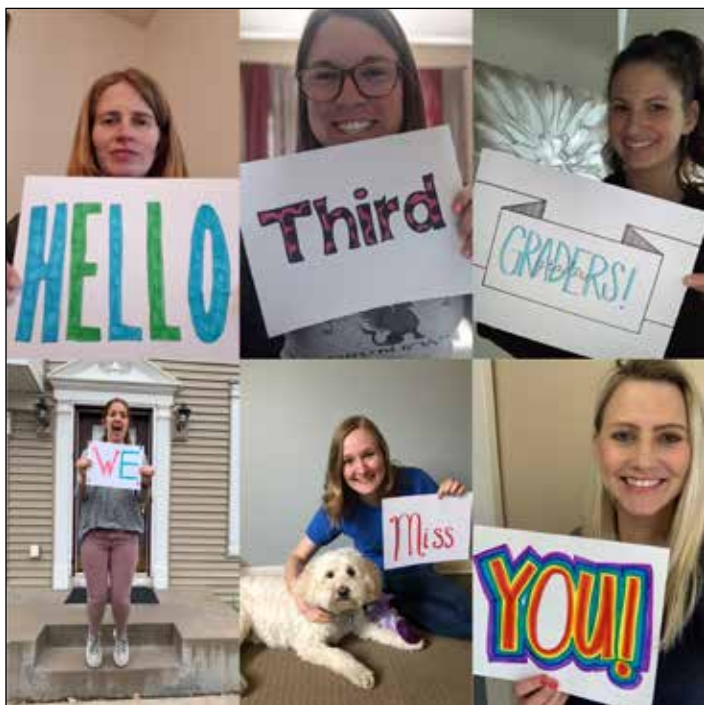
Third grade teachers prepared a special welcome for their students this week. We miss all of our Gryphons!

Again, thank you for your partnership as our School of Grammar Gryphons embark on their distance learning journey. Be safe and well.