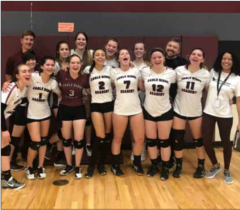
The Girls Volleyball team celebrated after their 3-2 victory over Lakes International Language Academy on Monday. This was the team's first post-season victory in school history.