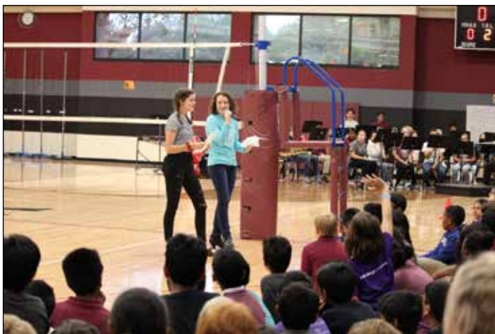
Student Senate's Homecoming Pep Fest was a blast for Grades 6-12, featuring the Gryphon Pep Band and Varsity Volleyball team.