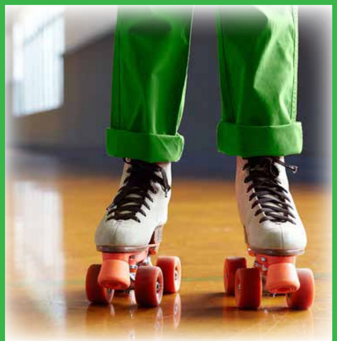
8th Annual Roller Skating Party March 9 • 4:30-6:30 • Roller Garden in St. Louis Park

Thank you to all who contributed to our Winter Contest! The results are being tallied and the winners will be announced on Friday, Feb. 22, on the PTO Facebook page. This means that NOW is the perfect time to start saving items for our next contest. Help your classroom win the final competition of the school year! Save your Box Tops, Coke caps, Milk Moola, Loaves4Learning UPCs, and Tyson Rewards! Go to the PTO page of the school website and click on See it...Save it! for more details.