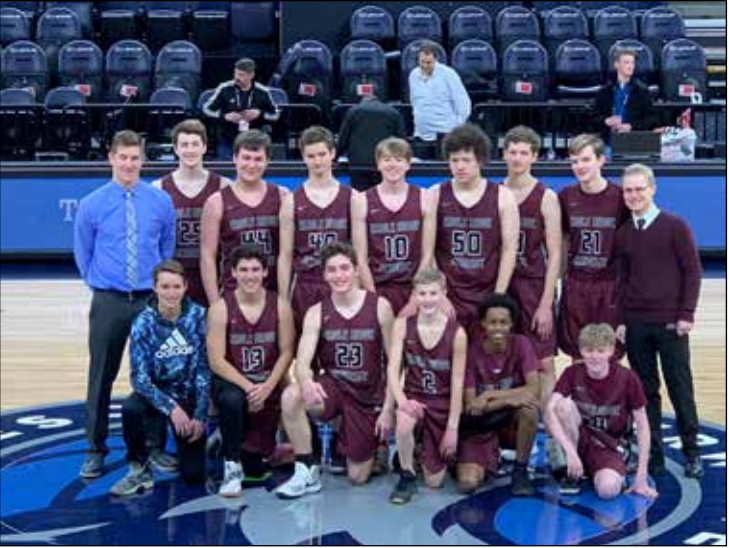
The Girls and Boys Varsity Basketball teams played Twin Cities Academy on Saturday, Jan. 19 at the annual Target Center game.