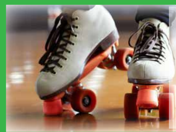
8th Annual Roller Skating Party March 9 | 4:30-6:30 Roller Garden in St. Louis Park Join us for the popular annual event! Admission includes a free glow necklace for every skater. This is a private party for K-8th grade families.