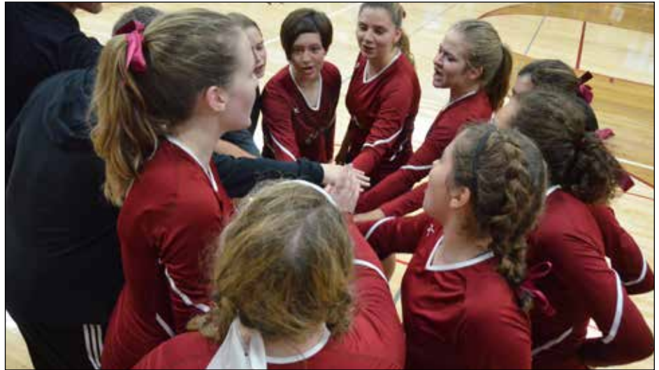
The volleyball team rallies during their game against Bethany Academy on Sept. 4.