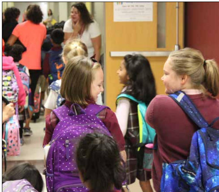
School of Grammar students walk to their classrooms on the first day of school, Monday, Aug. 27.

We seek to support each of our students in this type of pursuit of excellence each day they are with us. Our year is off to a great start thanks to our students, staff, and families. We're looking forward to another fruitful year of learning and growing.