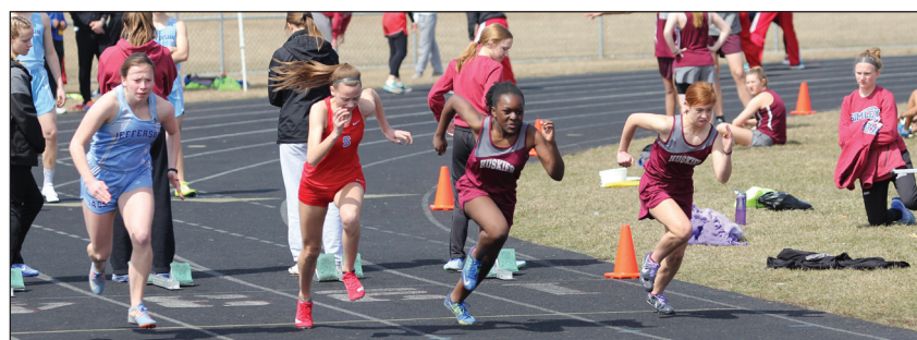
The Huskies track & field team competed at Cannon Falls on 4/21.