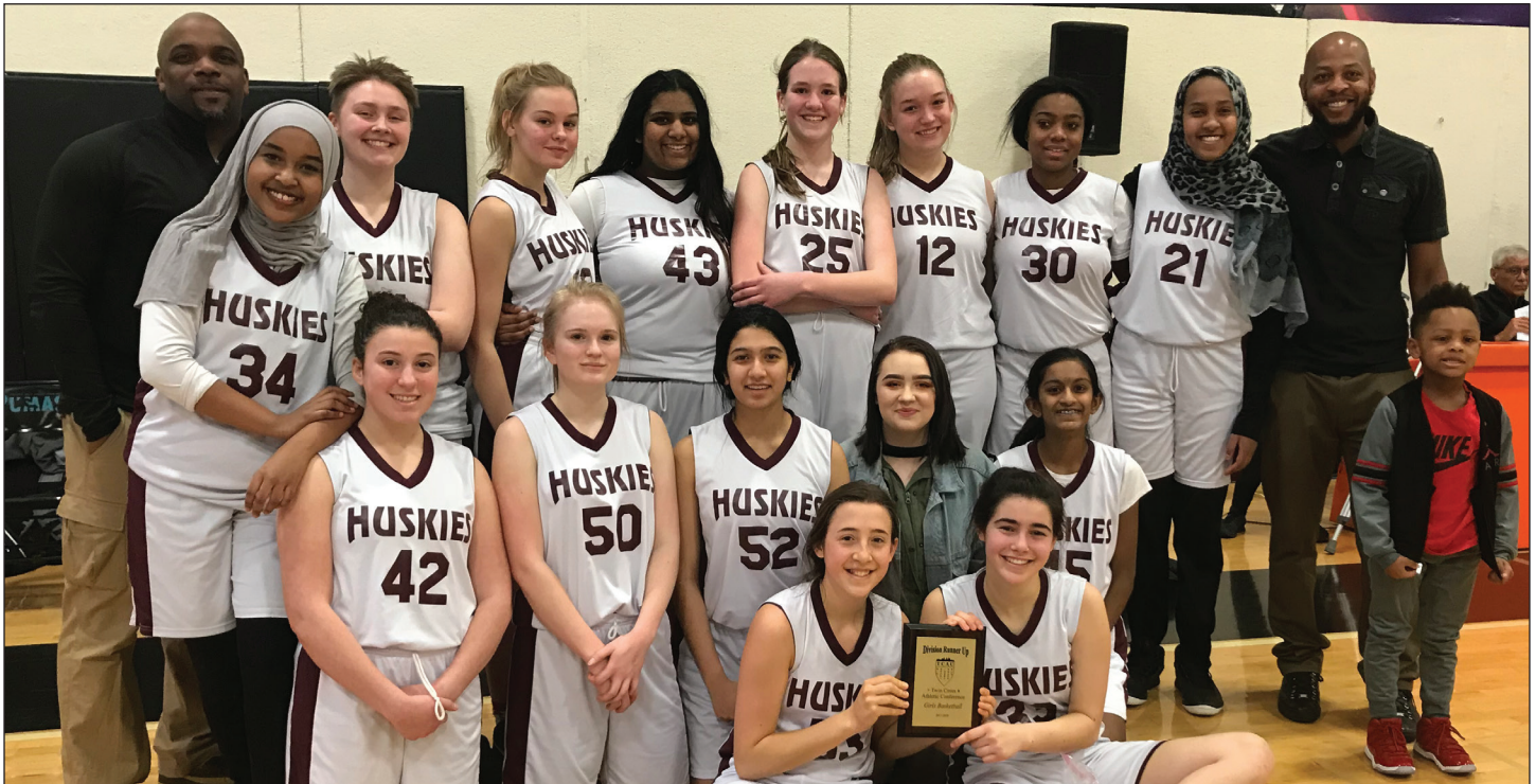
GO GIRLS! The ERA/ISM Huskies Girls Varsity Basketball team took second at the TCAC tournament this past weekend. The team will advance to the sections tournament on March 1.