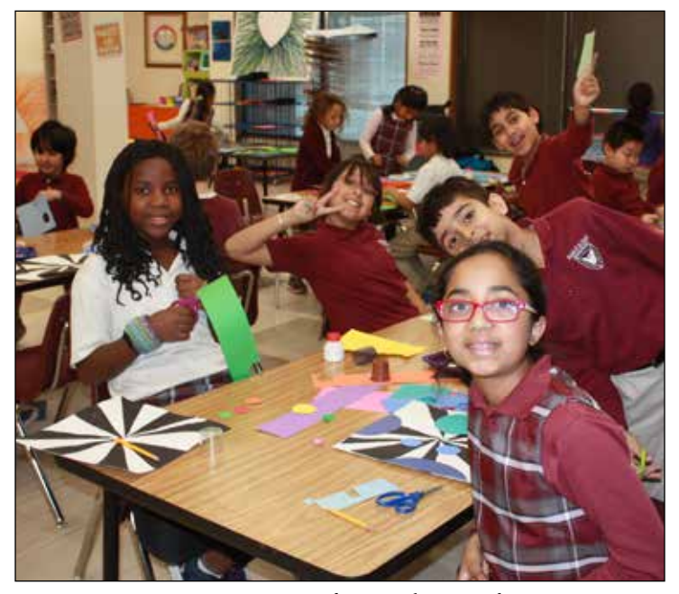
Impart Art students work on another exciting project.