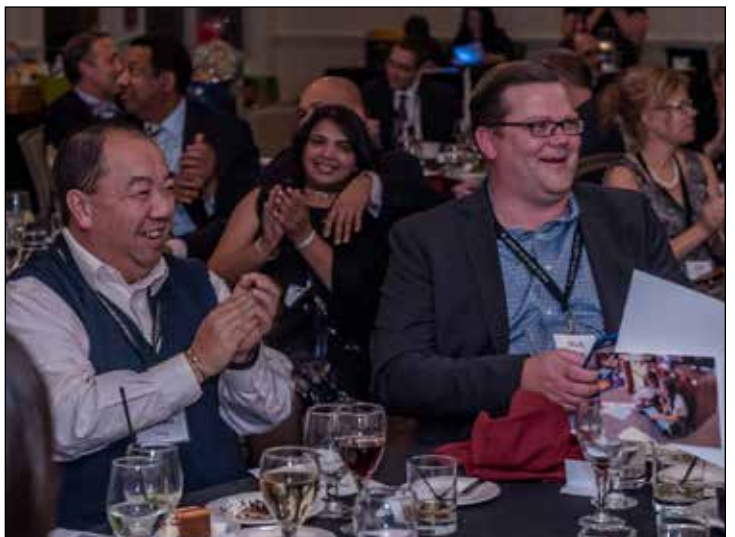
2017 Gala for the Gryphons. | PHOTOS BY SRIDHAR THAYUR