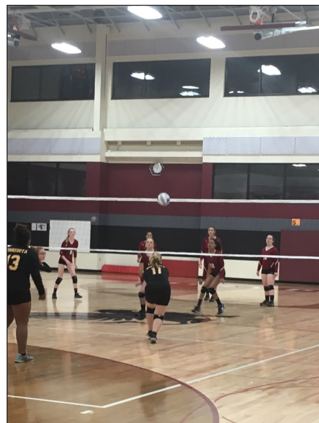
The ERA/ISM Huskies played their Homecoming game vs. the Minnesota Academy for the Deaf on Tuesday, Oct. 25. The Huskies won three out of four matches to claim the victory.

Nov. 12 – 1:00-3:00 p.m. – 3rd Grade Cake & Conversation