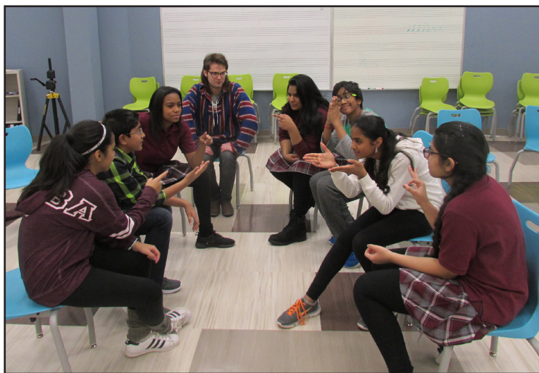
The 2016-17 ERA/ISM Debate Team